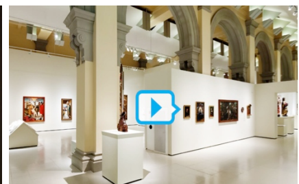
Virtual tours and navigation