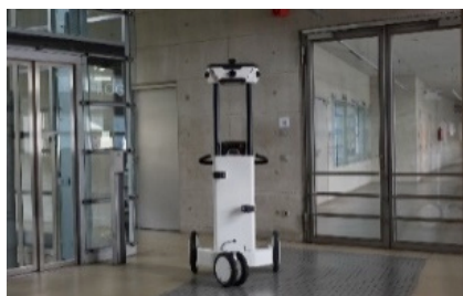
M3 mapping trolley